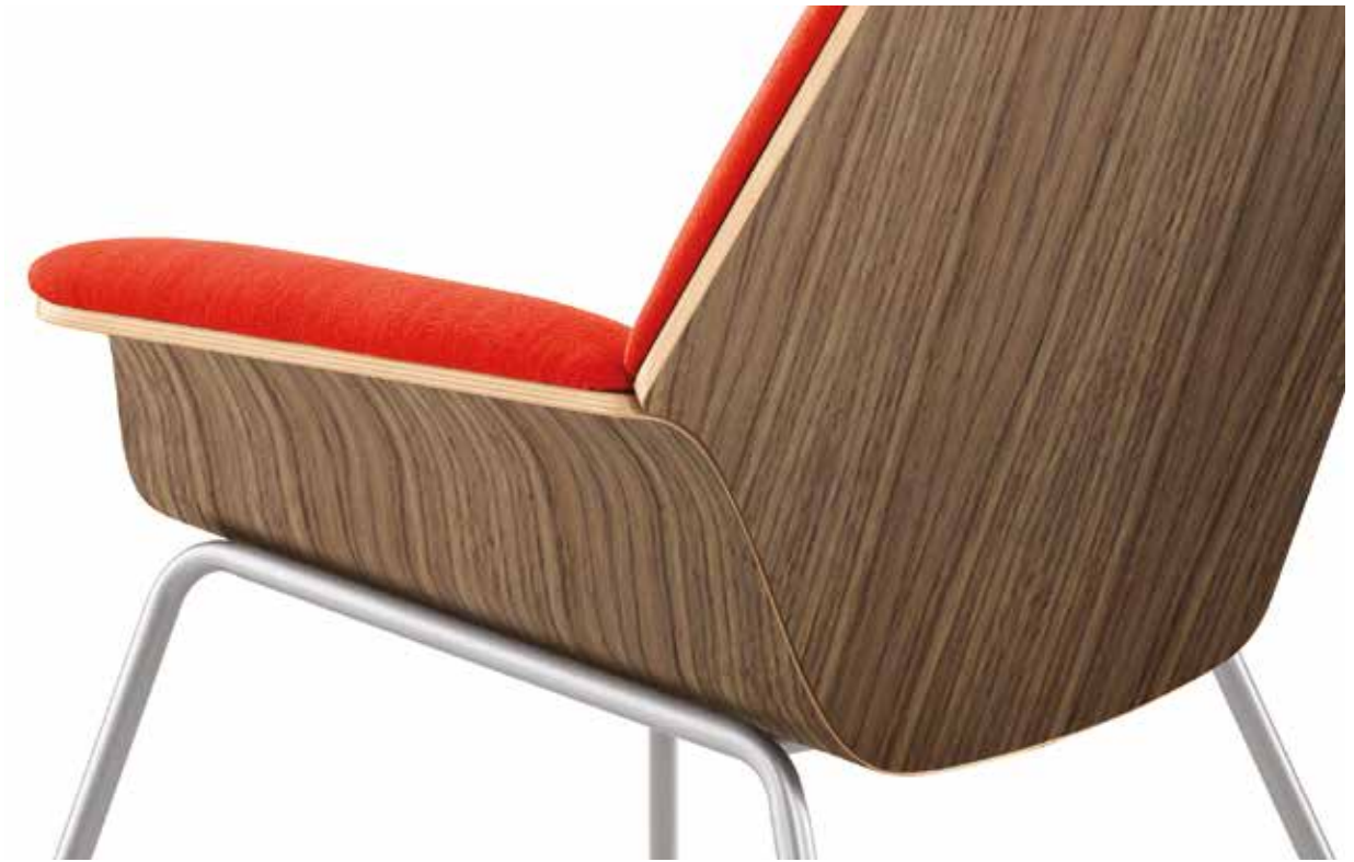
The exposed shell of the plywood lounge chair is a subtle reference to iconic designs from Herman Miller's heritage