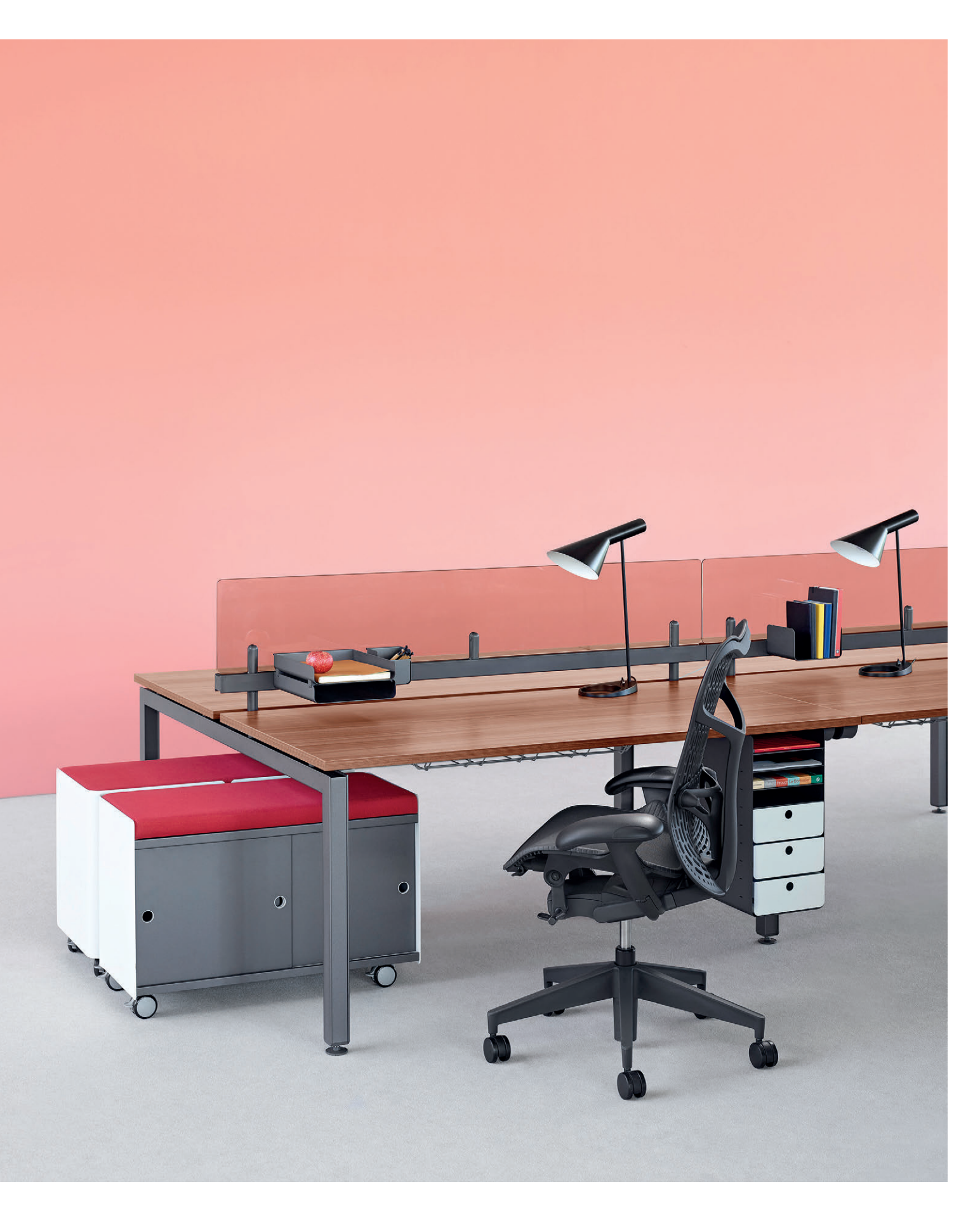
Typical desking configuration fully supported with mobile caddies, drawer, tool rail and glass screen.