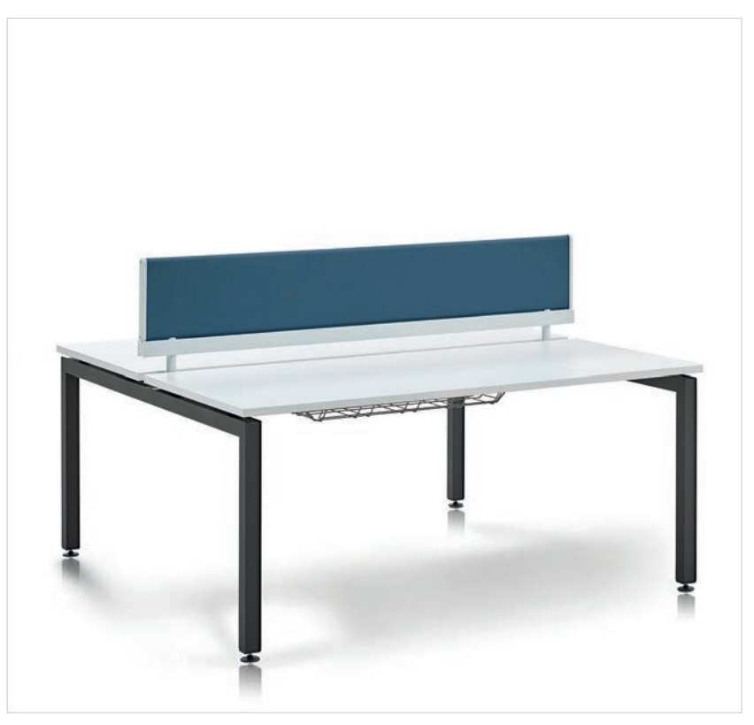
Sense desk shown with tool bar, screen, and wire basket